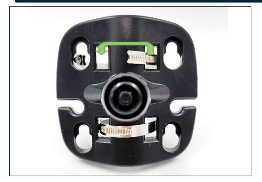
Insert the metal mounting clamps(both top and bottom) through the inner slots of the mounting plate