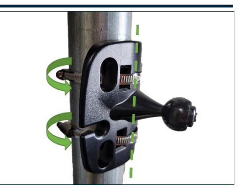
Loop the mouting straps around the pole at the desired position and tighten the strap until the mounting plate is fixed. Use the self centering feature to guide the mounting plate onto the pole