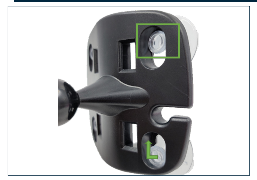
Insert the metal mounting clamps(both top and bottom) through the inner slots of the mounting plate