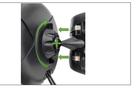
Insert the ball joint firmly into the socket on the back of the antenna body and slide the tightening nut into the antenna housing's back plate to secure in place. Adjust to the desired antenna orientation on the bal joint and tighten the nut to fix the antenna in place.