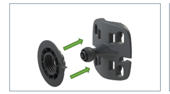
Insert the tightening nut onto the ball joint mount with the flat surface facing away from the mounting plate