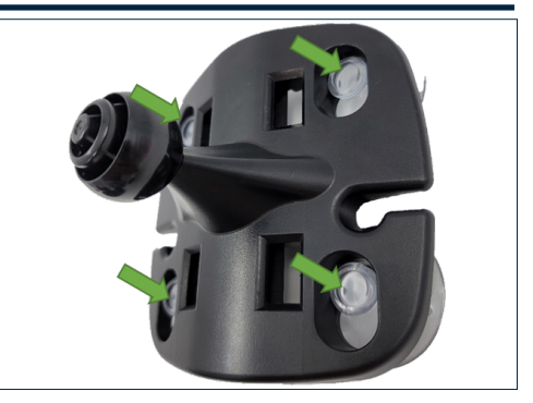
Using the mounting plate as guide on the mounting surface, align to the desired location of the antenna. Press firmly on each cup to secure in place Note: Check that the surface to mount on is flat, non-porous, and has been adequately cleaned to ensure proper adhesion.