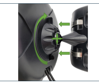
Insert the ball joint firmly into the socket on the back of the antenna body and slide the tightening nut into the antenna housing's back plate to secure in place. Adjust to the desired antenna orientation on the bal joint and tighten the nut to fix the antenna in place.