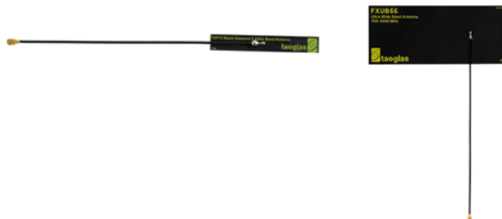
Vertical Polarization Position *